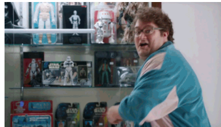
MY STORY AND MY NEIGHBORHOOD